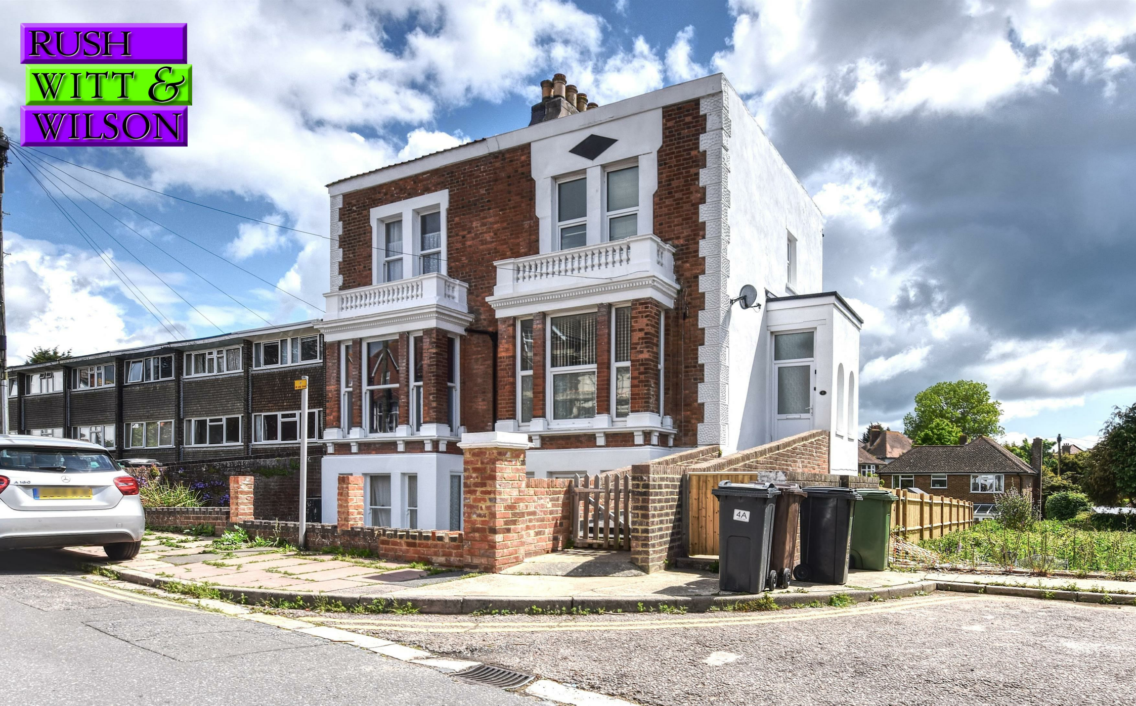
Maisonette, 4 Fairmount Road, Bexhill-On-Sea, East Sussex TN40 2HN £219,000